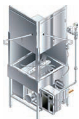
Dishwasher/ Warewash Machine