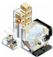
Fountain/Soda Equipment; Syrup Boxes/Bags