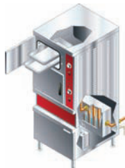
Steam or Combi Oven; Steam Tables