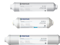
Inlines Variety of Applications