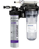
Kleensteam® CT Steam Applications